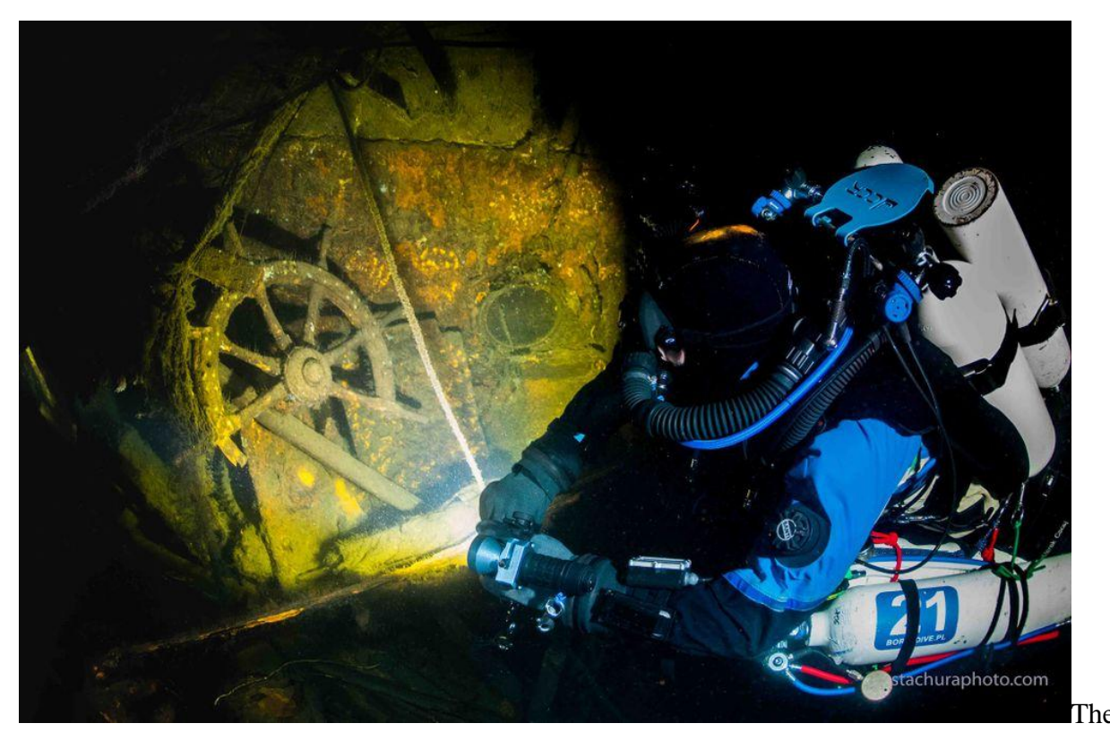
ship has been located off the Polish coast, a few dozen kilometres north of the seaside resort town of Ustka.

Polish divers have found the wreck of a WWII German steamer that they say might contain the long-lost Amber Room.