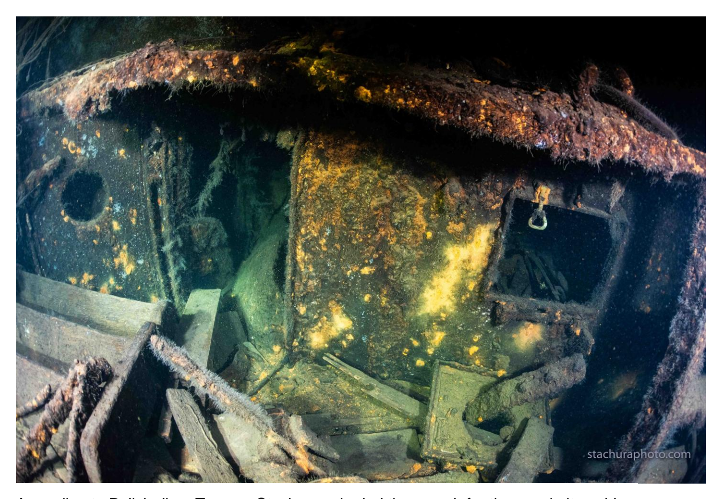
According to Polish diver Tomasz Stachura, who led the search for the wreck, it could "provide groundbreaking information on the disappearance of the legendary Amber Room".

The team had access to reports by the Soviet pilots who sank the ship in 1945, but even these mentioned five different positions.